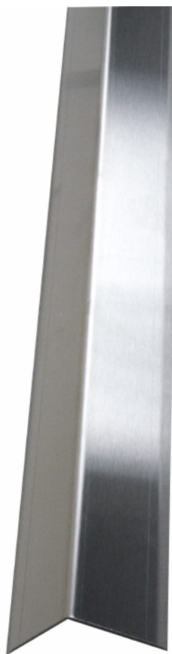
#4 Brush Stainless Steel