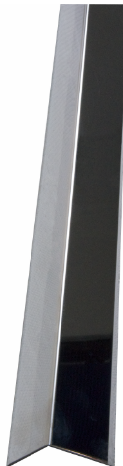
X-L Buff Stainless Steel